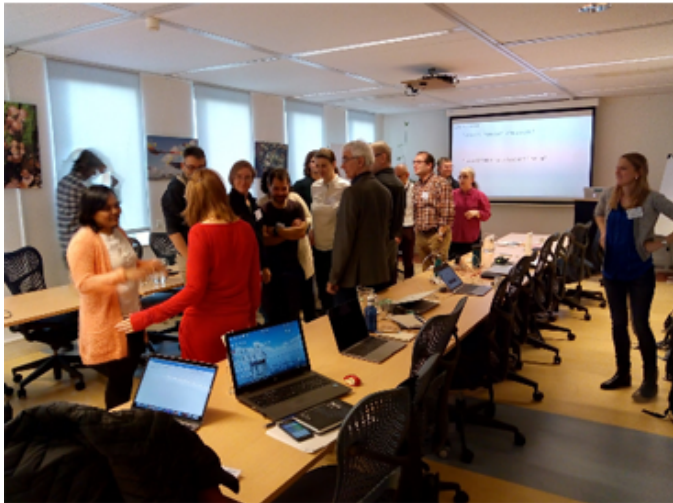
Figure 1: Starting the day with an icebreaker: line-up!"