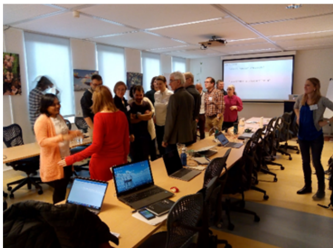
Figure 1: Starting the day with an icebreaker: line-up!"